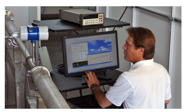
Calibration Technician performing an actual gas calibration in the flow laboratory.

All Fox meters are calibrated with NIST traceable flow standards. The Fox Thermal calibration lab employs a wide range of gases, mixtures, temperatures, pressures, and line sizes to simulate actual fluid and process conditions. This approach improves accuracy and minimizes measurement uncertainty in the field.