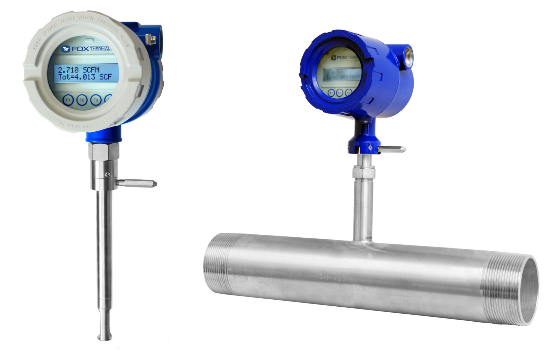
Fox Thermal model FT4X thermal gas mass flow meter and temperature transmitter with advanced data logger.