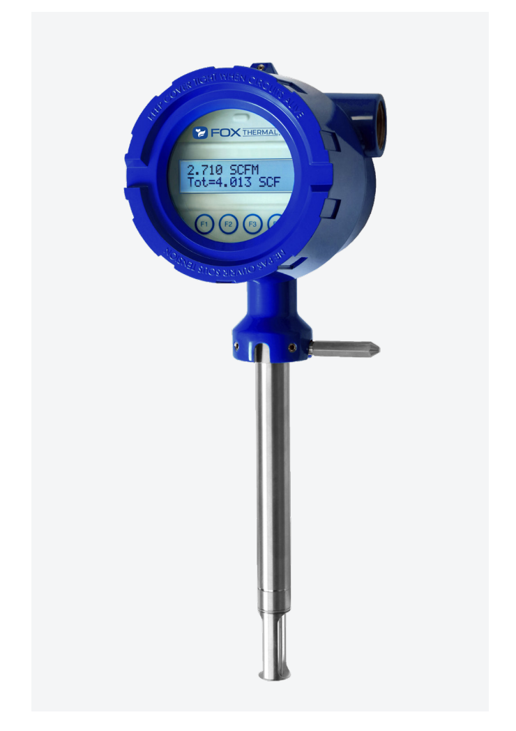
Get accurate gas flow measurement with a Fox Thermal flow meter.

In addition to the primary benefits of direct measurement of mass flow rate, low-flow sensitivity, and fast response, the thermal flow meter's no-moving parts design also helps reduce maintenance costs.